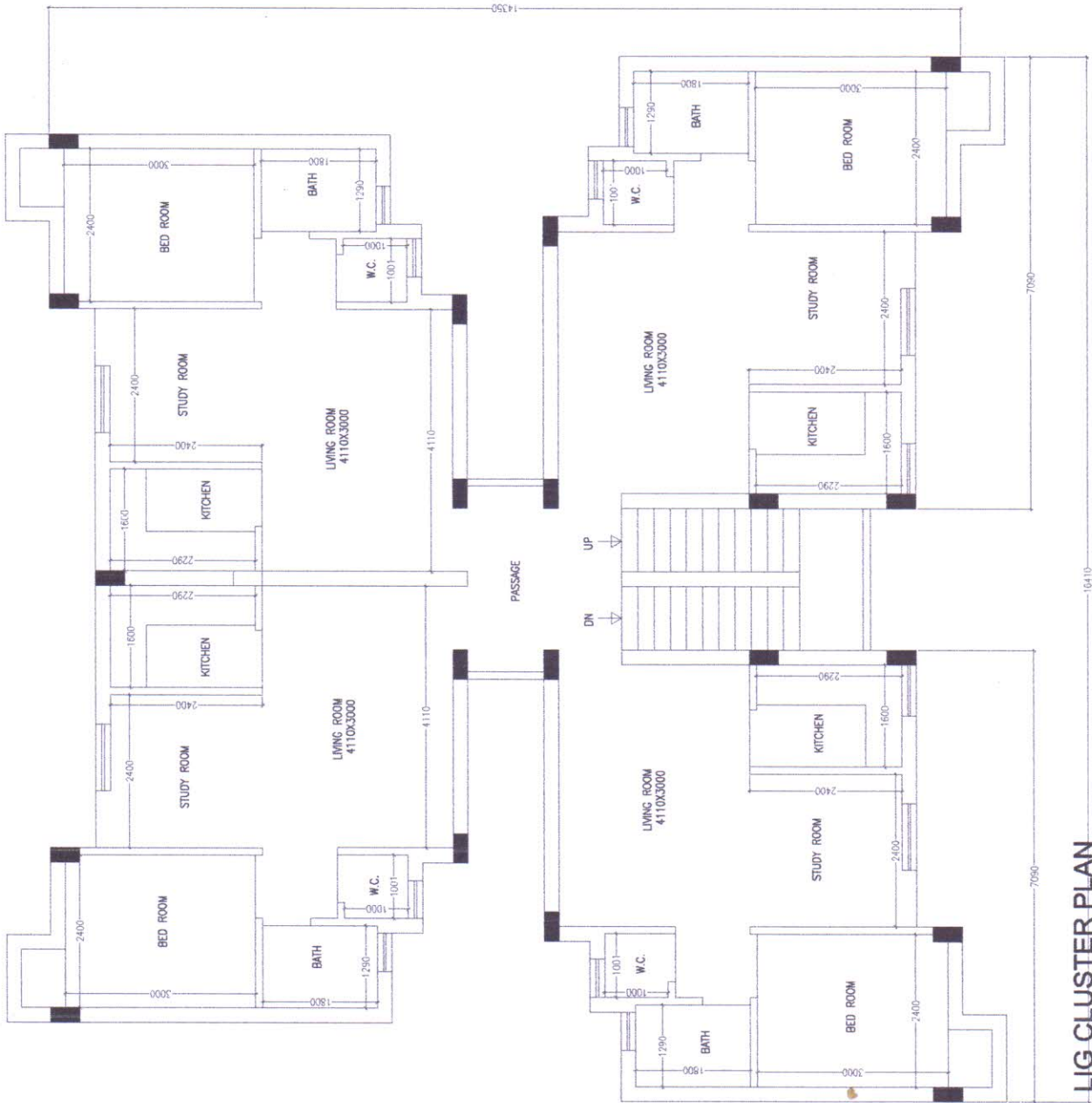
LIG CLUSTER PLAN